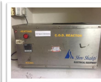
C O D Reactor