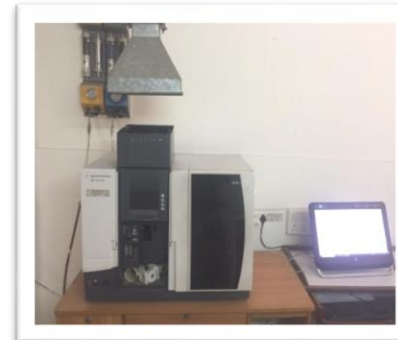
Atomic Absorbance Spectrophotometer