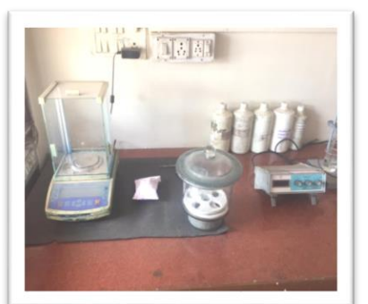
SAB Analytical Balance